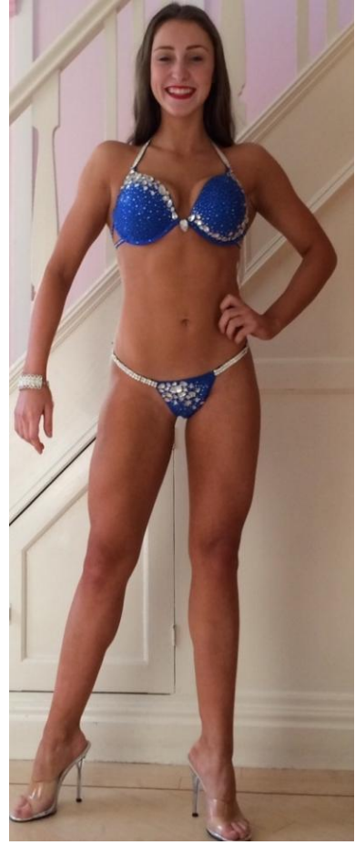
FRONT STANCE -----